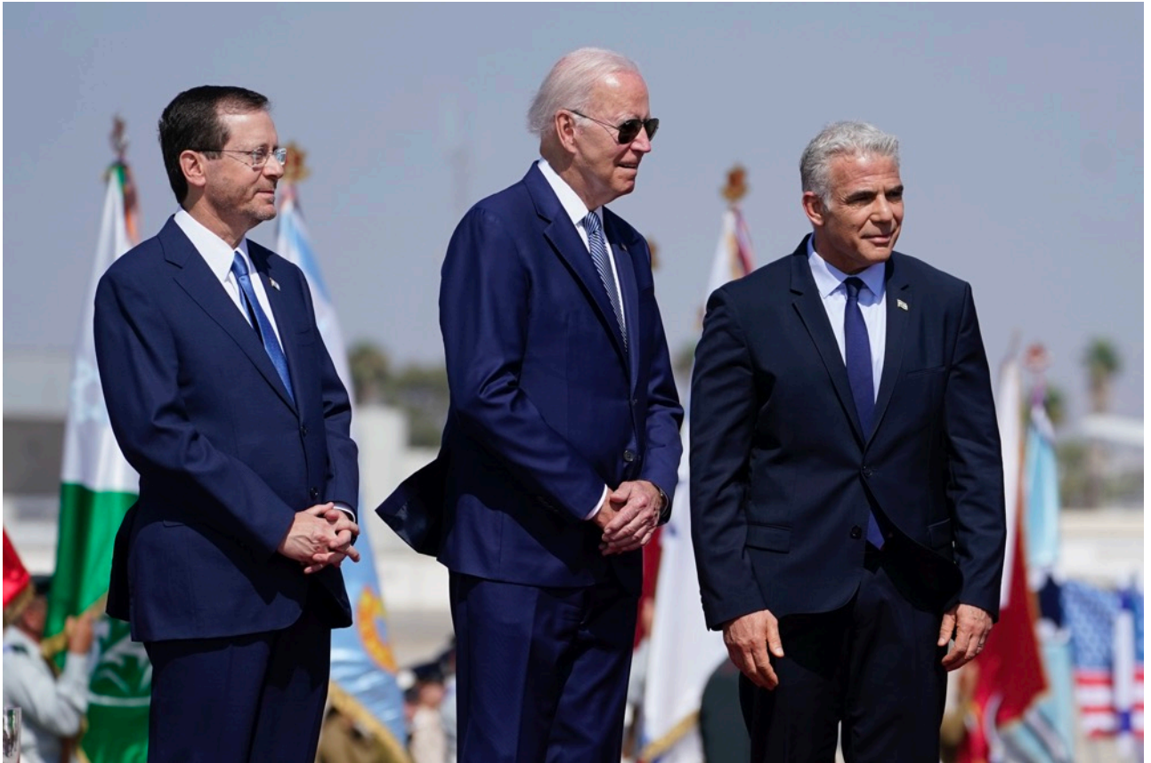
President Joe Biden stands with Israeli Prime Minister Yair Lapid, right, and President Isaac Herzog, left, after arriving at Ben Gurion Airport, Wednesday, July 13, 2022, in Tel Aviv.

After completing trip to Israel and Palestine, Biden will fly directly to Jeddah, experts see this development as a clear indication of Saudi Arabia's growing acceptance of Israel following decades of boycotting Israel in support of the Palestinians. Prime Minister Yair Lapid said that we are sending a message of peace to Saudis through President Biden. Along with President Biden his secretary of state, Antony Blinken will attend a regional summit in Saudi Arabia. Biden defended his statement against Saudi Arabia given in 2019, by aiming to "reorient but not rupture relations with Riyadh". There are reports that the US will try to reach an agreement on increased defense cooperation between Israel and various Arab countries in order to counter the threat posed by Iran. Also, amid increased prices because of the Ukraine war, it is expected that discussions will be made for oil and energy as Saudi Arabia is one of the world's largest oil producers. The efforts which are being made by Biden with Arab countries for Israel represent his commitment to Israel's security, but this could enhance the existing tensions between the regional countries particularly Iran while influencing the region's stability and security.