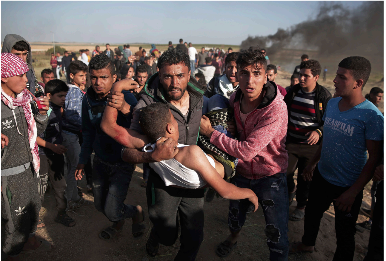
Palestinian protesters carry a wounded man who was shot by Israeli troops during a protest near the Gaza Strip border with Israel, in eastern Gaza City, Saturday, March 31, 2018.

Role of mainstream media is not prominent in case of Israel-Palestine conflict. There is a very minimal role of social media but that is not enough. Media should unleash the world about the atrocities committed in Gaza strip by the Israel. The world know very less about what is happening in Gaza. There are apparent war crimes being committed in Gaza which needs to be covered by the digital media. Very few reports are there on the war crimes and that too are on the print media. Israel's behavior is represented less negatively. Their human rights violations and war crimes are not labeled as that what they are but, in fact, they are just considered as the violence in conflict.